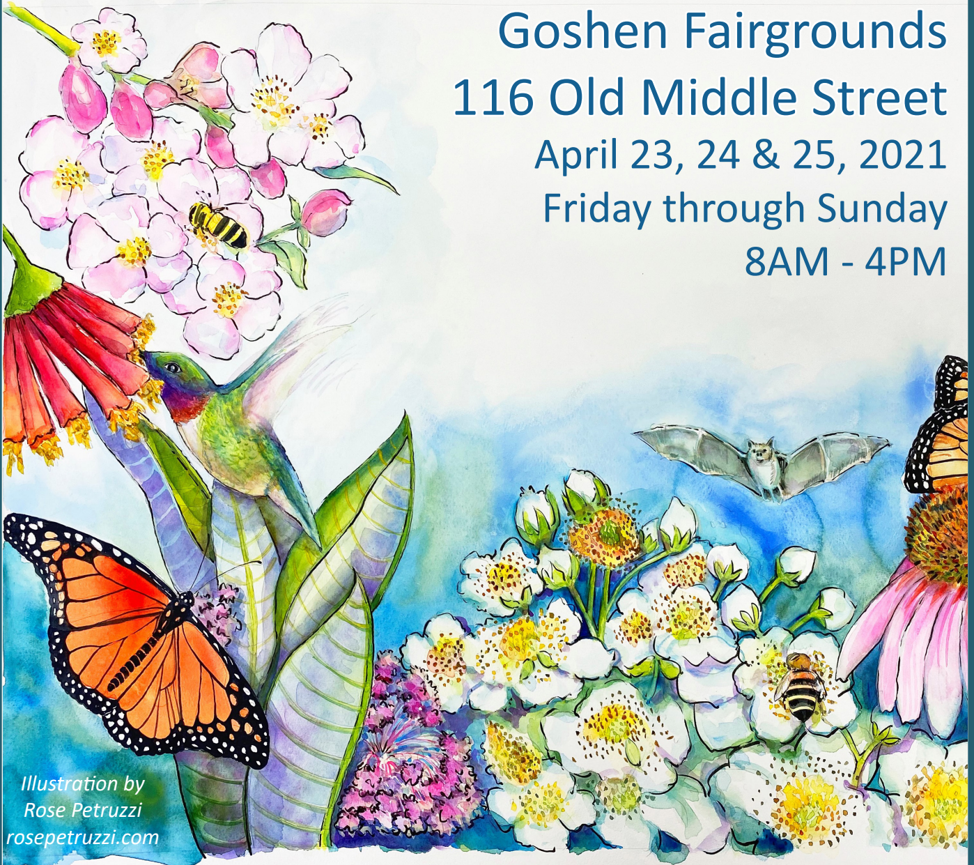
Illustration by Rose Petruzzi rosepetruzzi.com

“Never doubt that a small group of thoughtfully committed citizens can change the world. Indeed, it’s the only thing that ever has.” ~ Margaret Mead, original Earth Day supporter