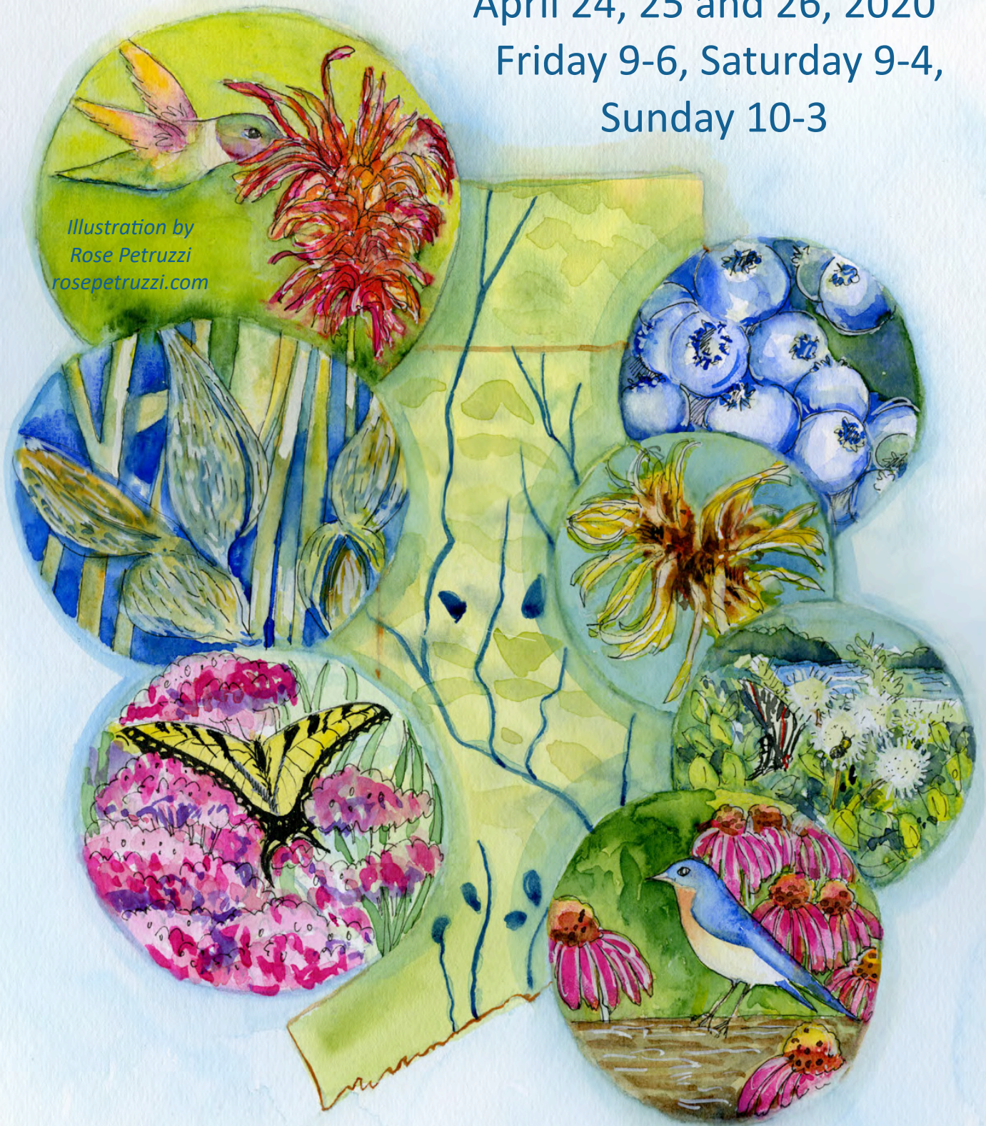
Illustration by Rose Petruzzi rosepetruzzi.com

Celebrate the 50th Anniversary of Earth Day! Goshen Fairgrounds, 116 Old Middle Street