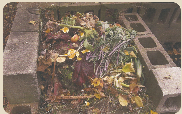
Cynthia Rabinowitz, NWCD Executive Director

Hot composting requires more attention to the pile which will need to be turned more often to rotate the materials top to bottom, and side to side. Cold composting is turned less often but takes longer to break down into the finished dark, crumbly material ready for the garden. For Detailed instructions on building piles for hot or cold compost, and for handling the pile, visit the UConn website: https://blog.extension.uconn.edu/2014/09/08/the-basics-of-composting/